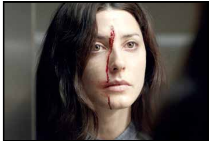
MAGICAL GIRL, March 28, April 1