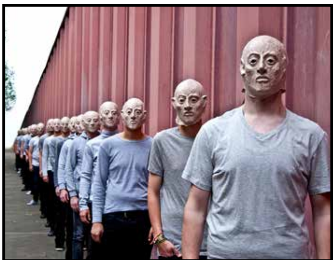
NEVER DIE YOUNG , March 28, April 1