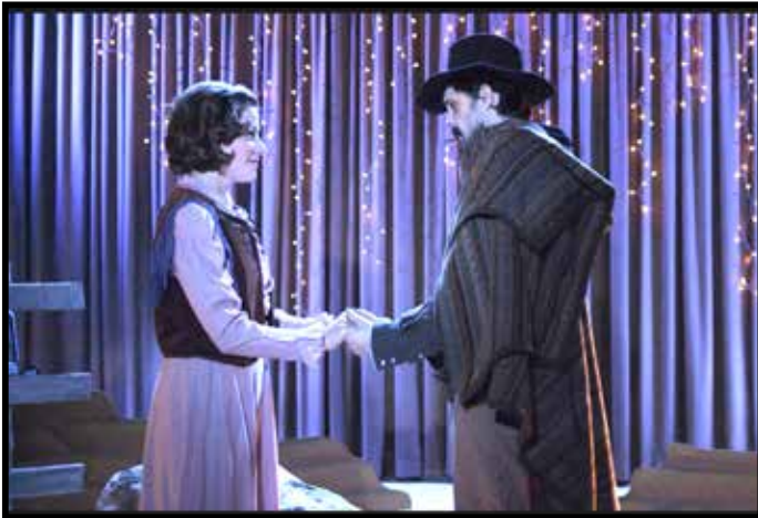
COWBOYS , March 22, 23