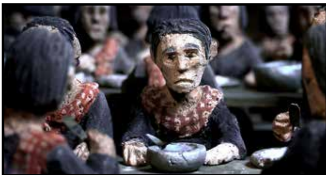
THE MISSING PICTURE, March 10