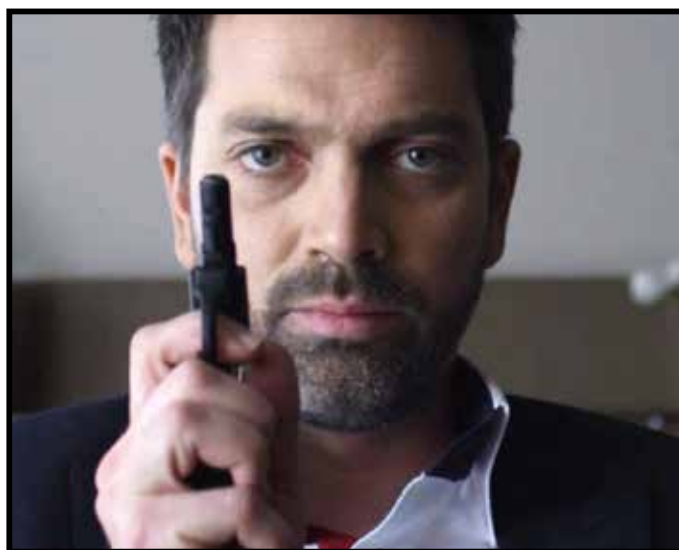
THE CANDIDATE, March 27, 31