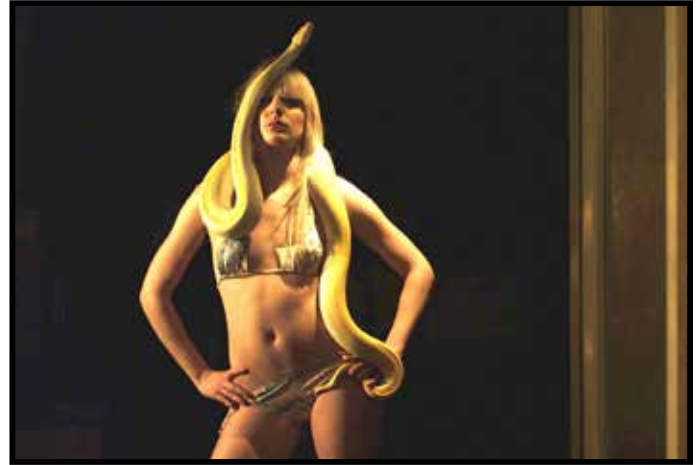
FIELD OF DOGS , March 15, 18