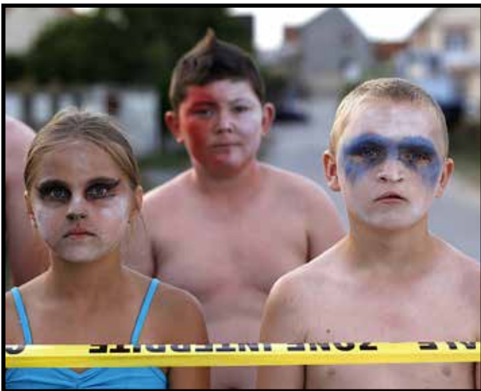
L'I L QUINQUIN, March 7, 9