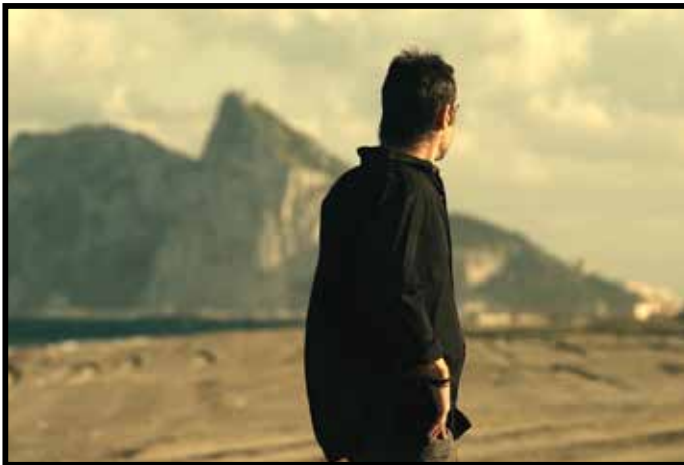
THE KID, March 8, 11