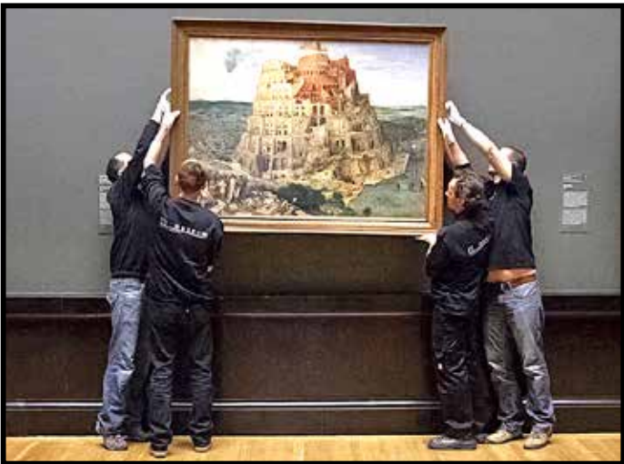
THE GREAT MUSEUM, March 14, 18