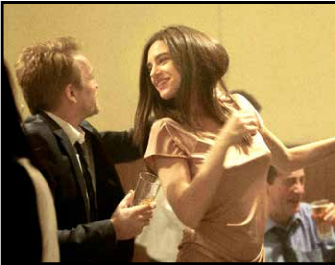
WASTE LAND, March 7, 12