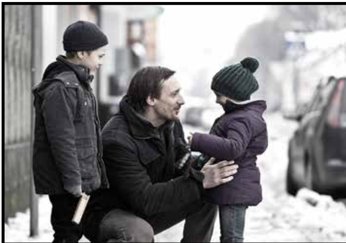
INFERNO , March 8, 10