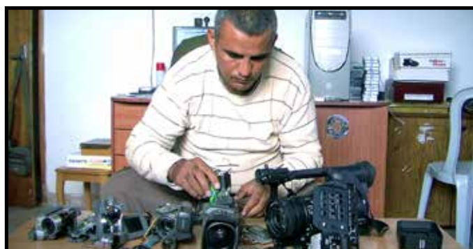
FIVE BROKEN CAMERAS, March 24