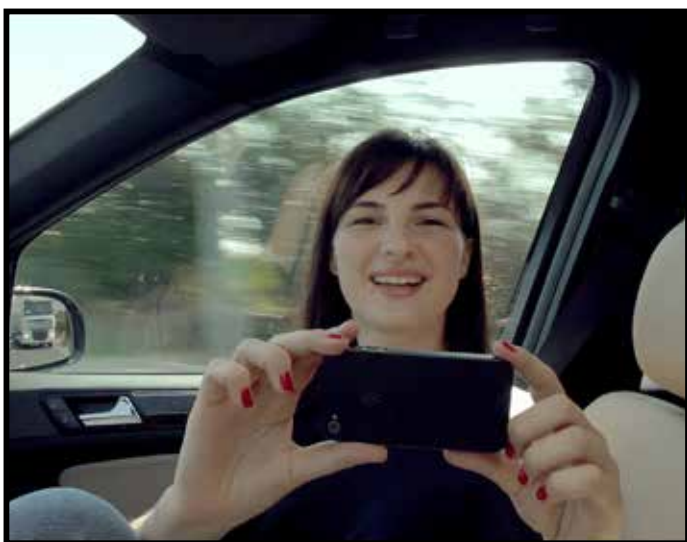
DÉJÀ VU, March 7, 11