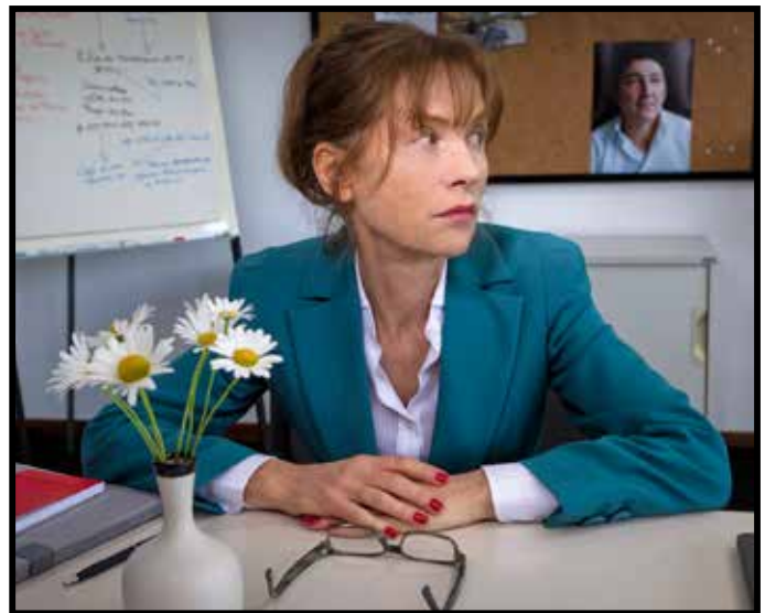
TIP TOP, March 20, 22