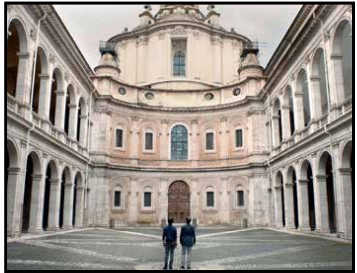
LA SAPIENZA, March 14, 16