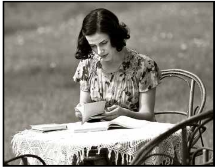
IN THE CROSSWIND, March 29, 30