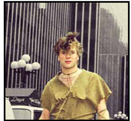
SOUL BOYS OF THE WESTERN WORLD, March 7