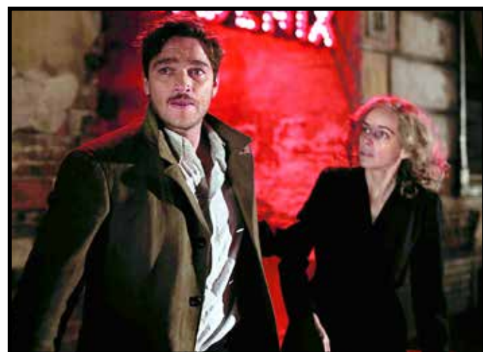
PHOENIX , March 28