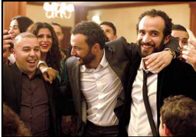
THE INTRUDER , March 22, 25