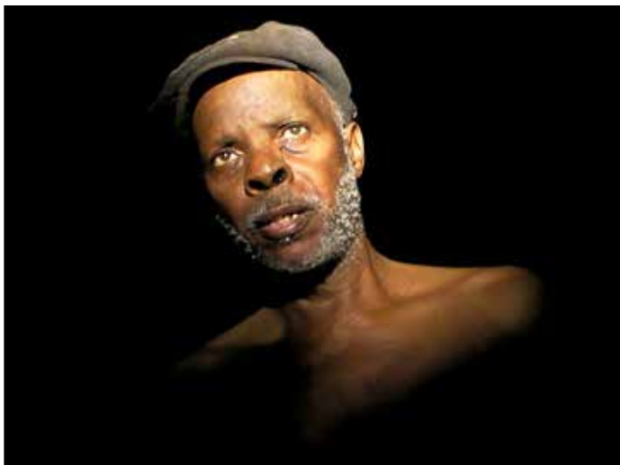
HORSE MONEY, March 20, 23