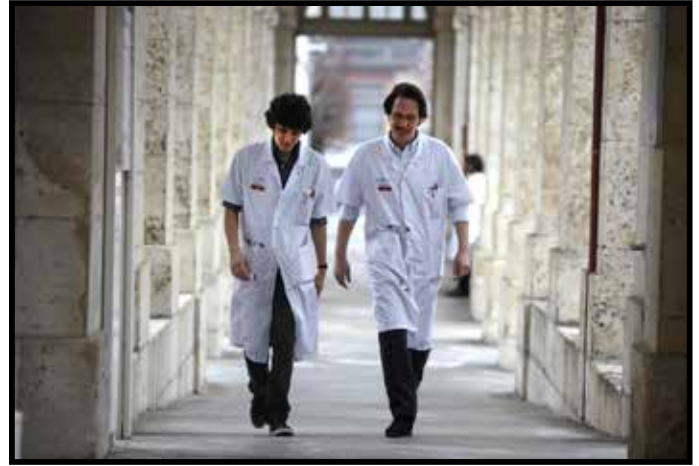
HIPPOCRATES , March 27, 30