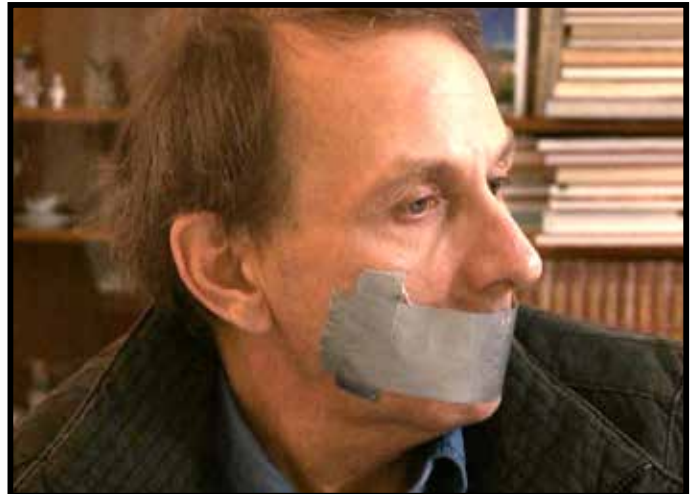
THE KIDNAPPING OF MICHEL HOUELLEBECQ , March 21, 23