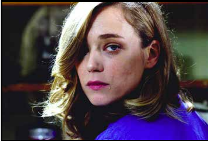
A STEP INTO THE DARK , March 14, 18