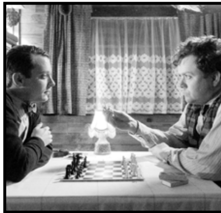
SET FIRE TO THE STARS, March 21, 25