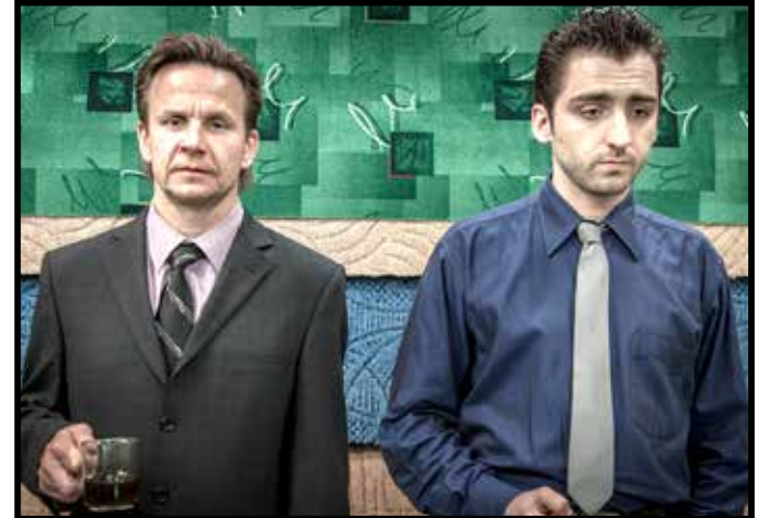
KEBAB & HOROSCOPE , March 29, April 1