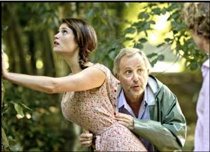
GEMMA BOVERY , March 8, 12