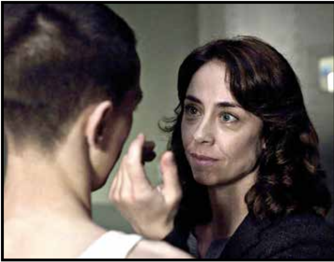
THE HOUR OF THE LYNX, March 26