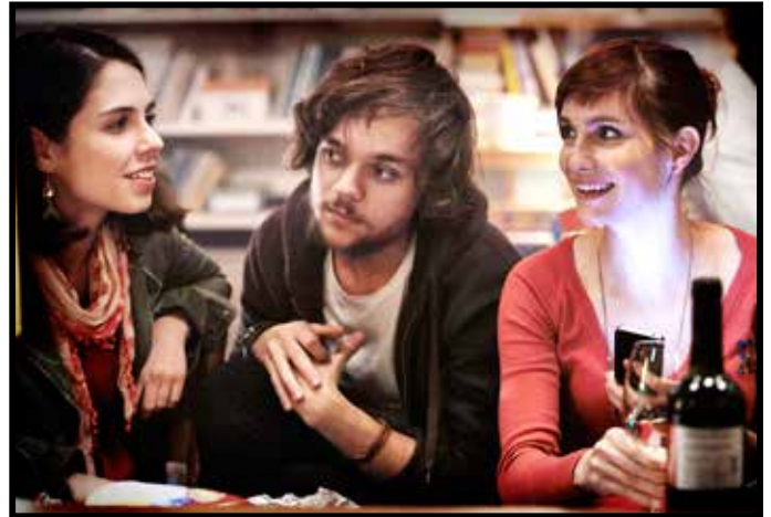
HANY , March 15, 18