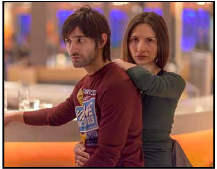
STANDING ASIDE, WATCHING, March 13, 16