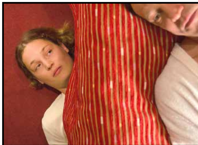
THE CHAMBERMAID , March 29, 30