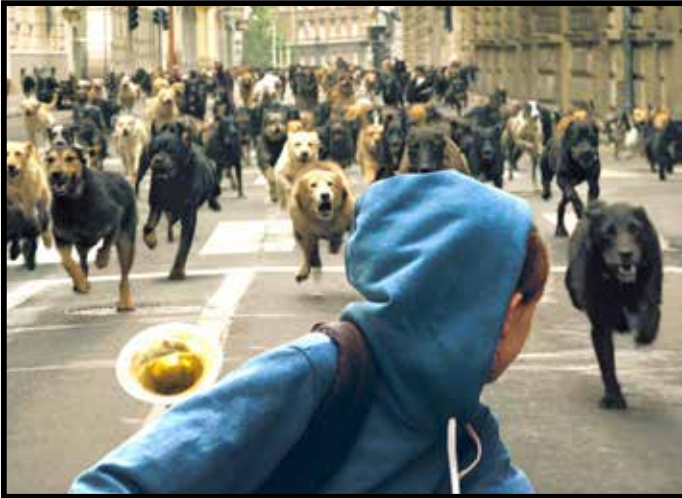
WHITE GOD, March 11