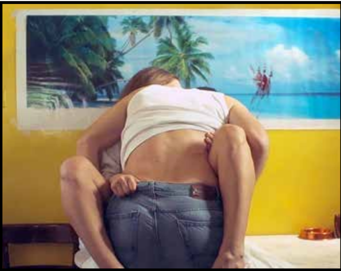
THE SENTIMENTALISTS, March 20, 23