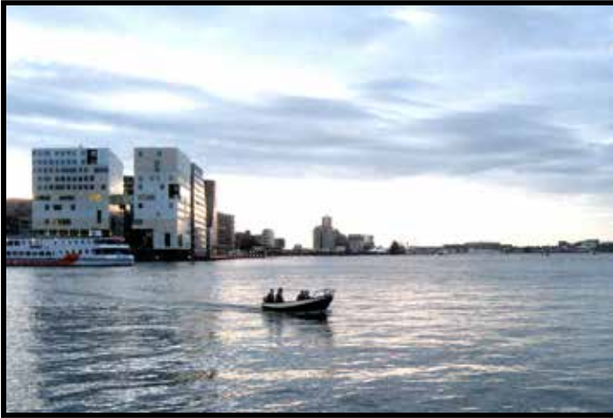
AFTER THE TONE , March 15, 16