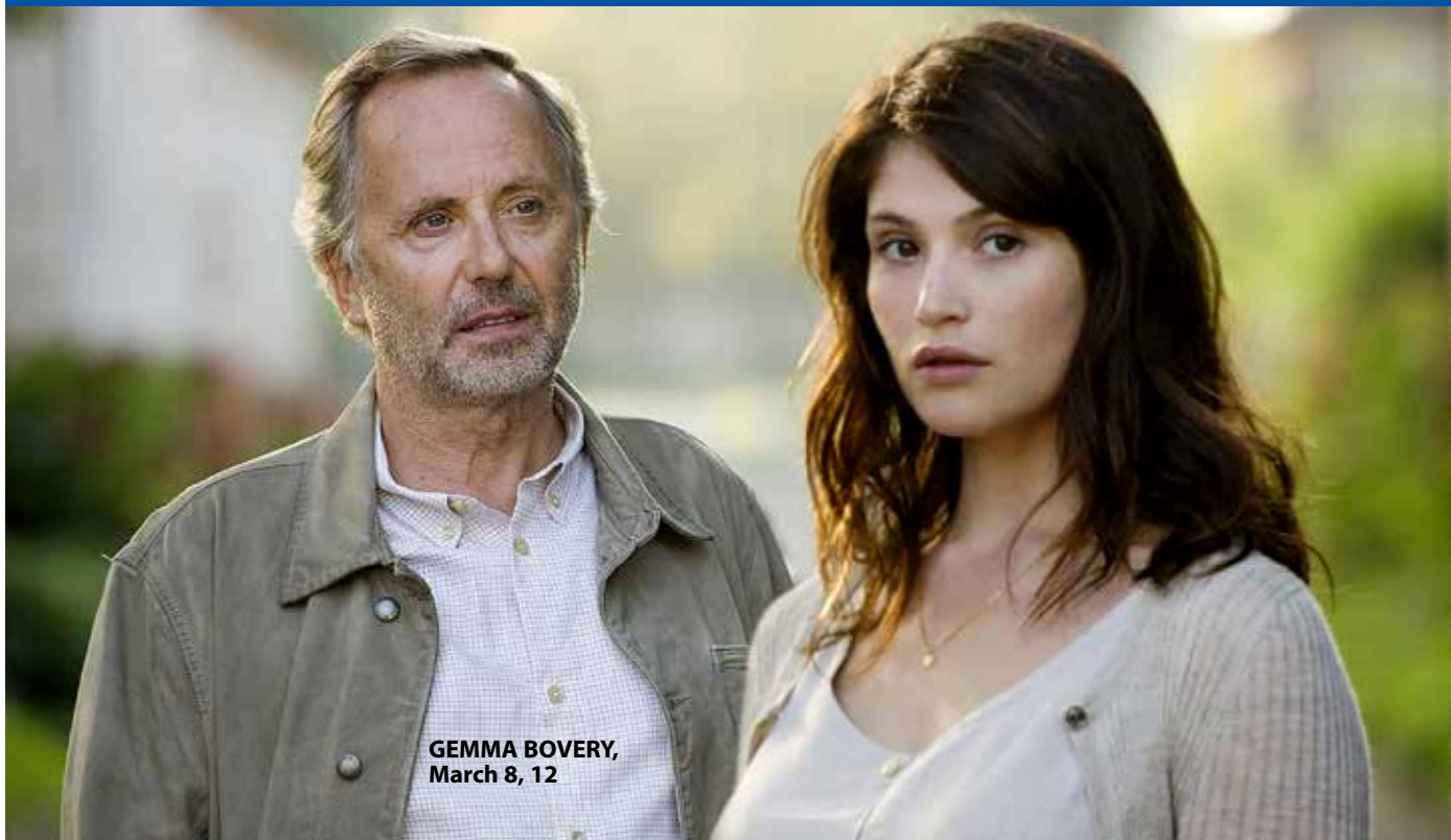
GEMMA BOVERY, March 8, 12

From March 6 through April 2, the Gene Siskel Film Center welcomes you to the 18 th Annual European Union Film Festival , a colorful and diverse European escape from the Chicago winter. This largest showcase in North America for the cinema of the European Union nations presents Chicago premieres of 61 new feature films from 27 nations.