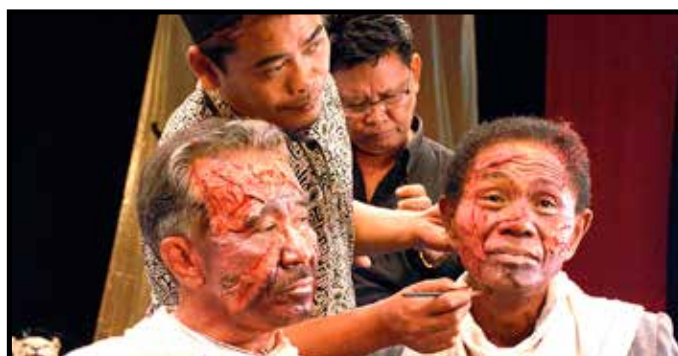
THE ACT OF KILLING, March 17