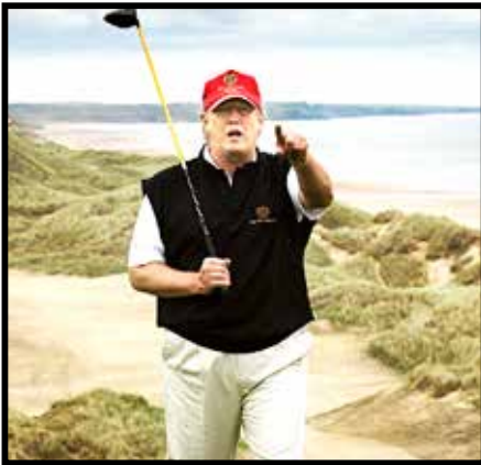
A DANGEROUS GAME, March 29