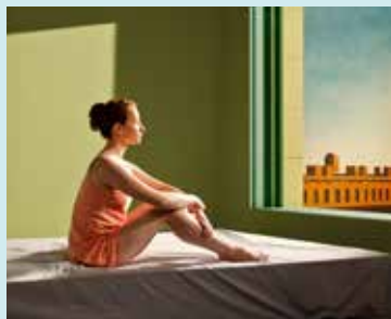
SHIRLEY: VISIONS OF REALITY

Join us for the Gene Siskel Film Center Movie Club, which will include a post-screening conversation and a complimentary cocktail at Virgin Hotels Chicago, 203 N. Wabash. Movie ticket required for entry.