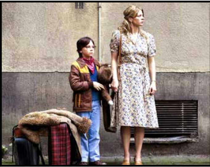
WEST, March 21, 25