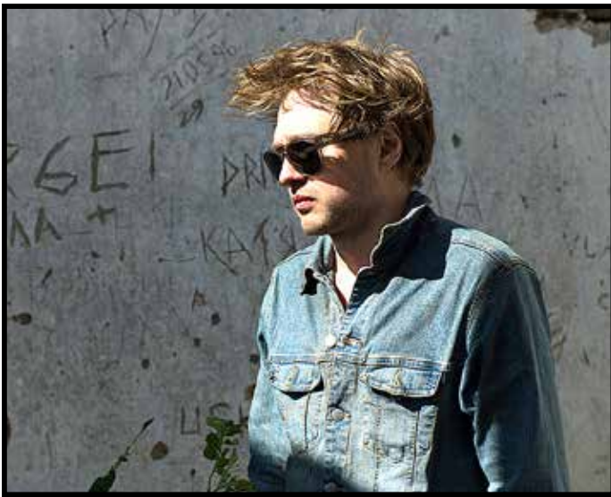
FREE RANGE, March 13, 16