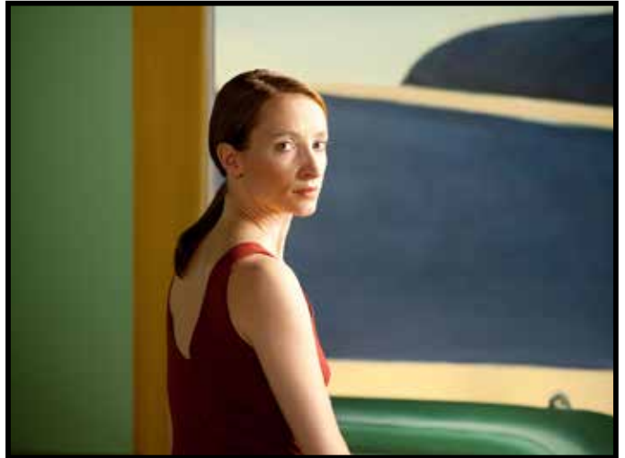
SHIRLEY: VISIONS OF REALITY, March 27, 28