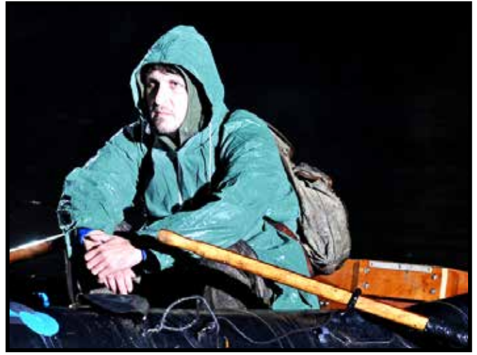
THE JUDGEMENT, March 8, 12