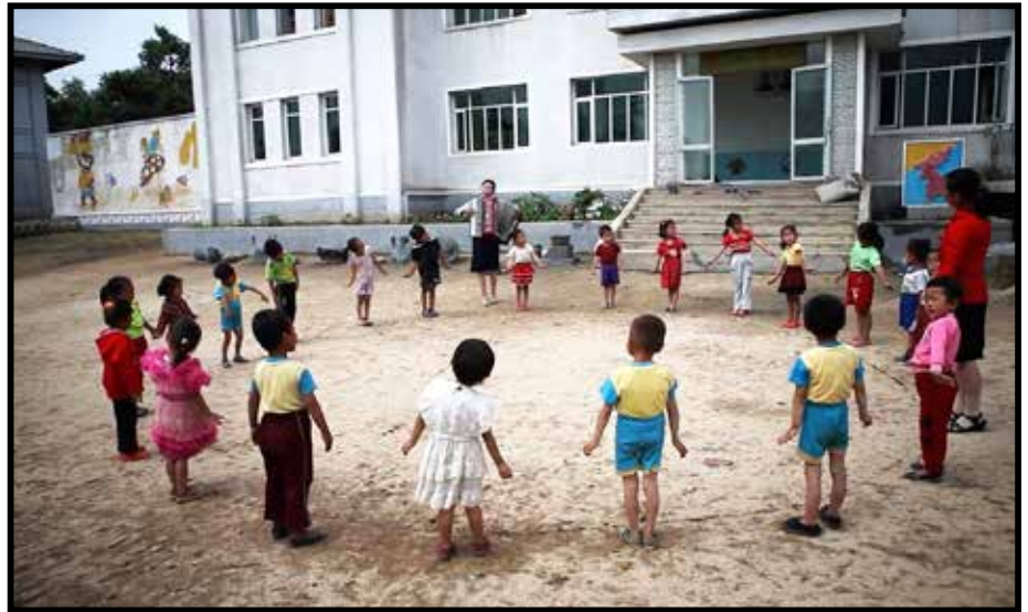
SONGS FROM THE NORTH, March 26