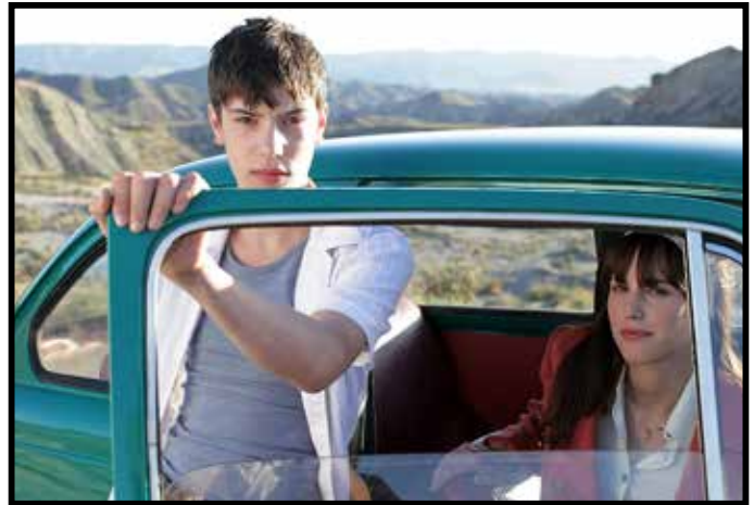
LIVING IS EASY WITH EYES CLOSED, March 13, 15