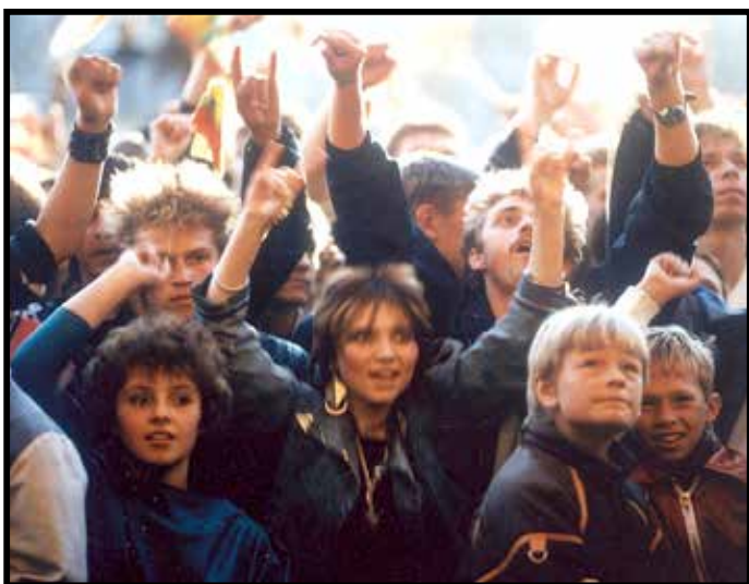
HOW WE PLAYED THE REVOLUTION , March 21, 25