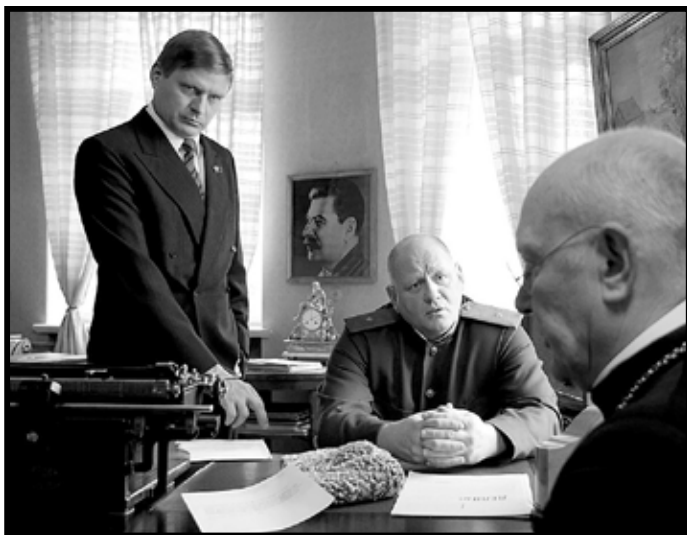
ALIAS LONER , March 29