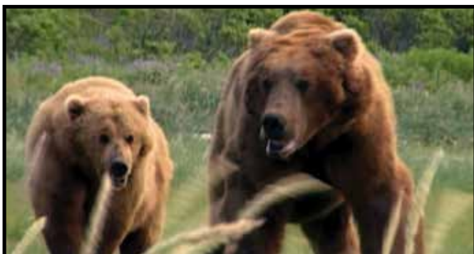
GRIZZLY MAN, Feb. 27, March 3