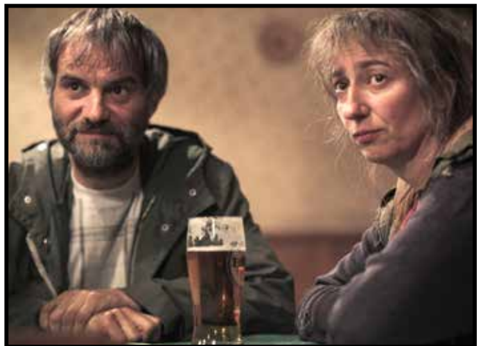
NOWHERE IN MORAVIA , March 22, 26