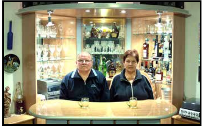
IN THE BASEMENT, March 7, 11