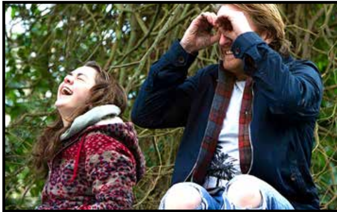
GOLD, March 21, 22