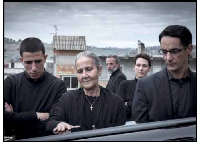
BLACK SOULS, March 14