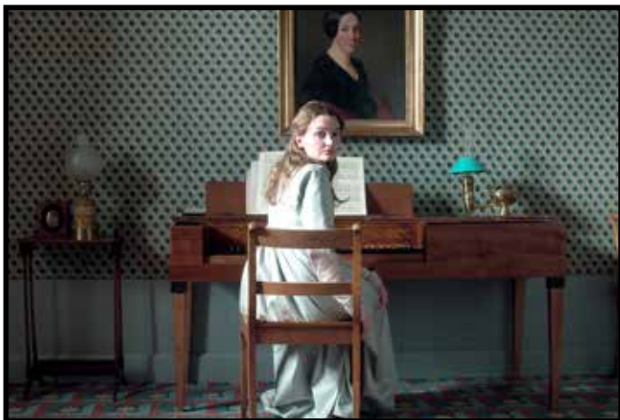
AMOUR FOU , March 8, 9