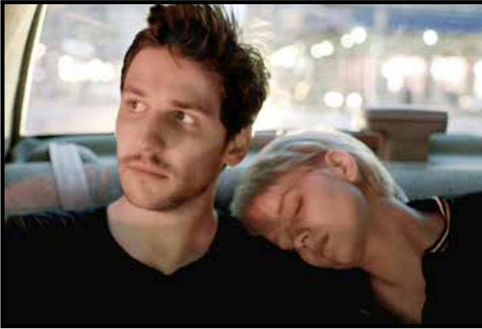
EDEN , March 29, April 1