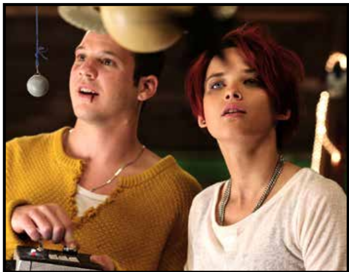
MAMA'S BOY , March 14, 19