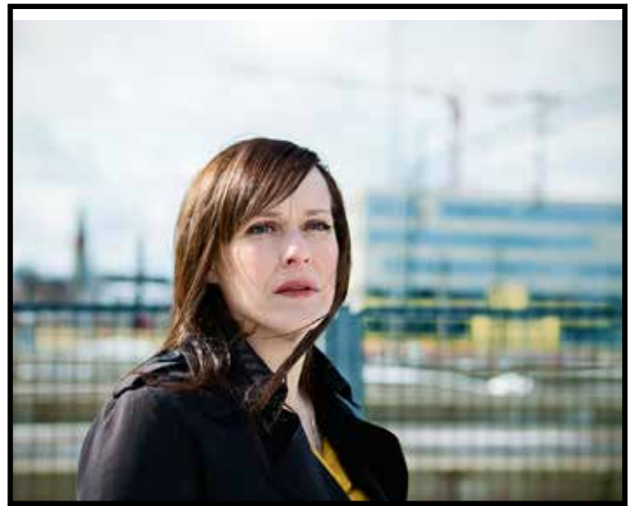
OPEN UP TO ME, March 27, 31