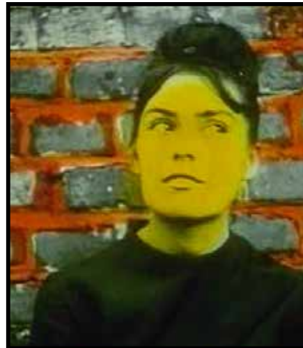
ENCOUNTERS, March 12