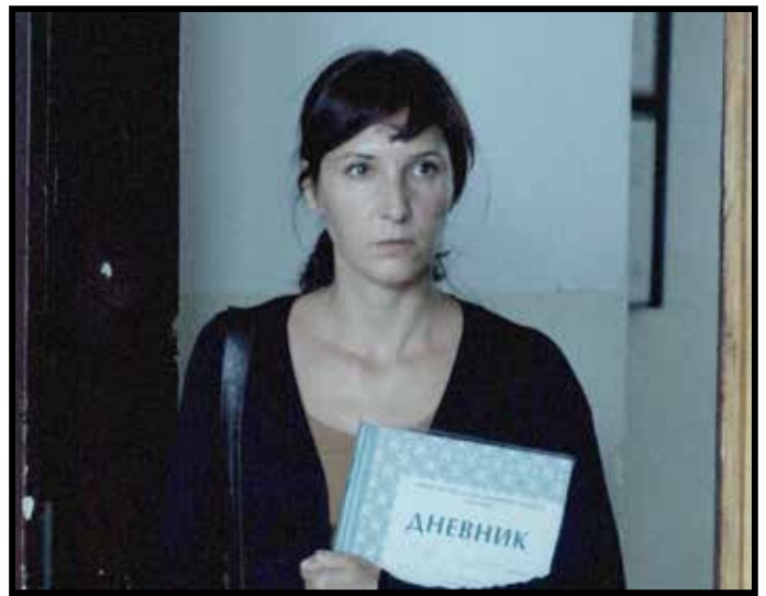
THE LESSON, March 14, 19