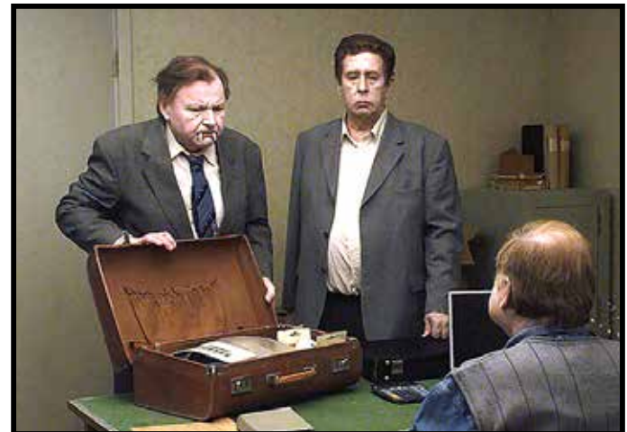
A PIGEON SAT ON A BRANCH... , March 17