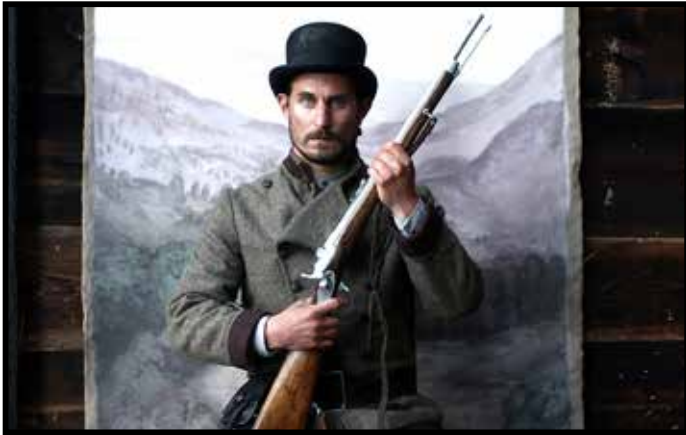
THE DARK VALLEY, March 22, 24