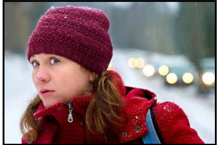
HALLÅ HALLÅ , March 7, 10