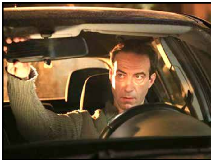
ROXANNE, March 28, 30