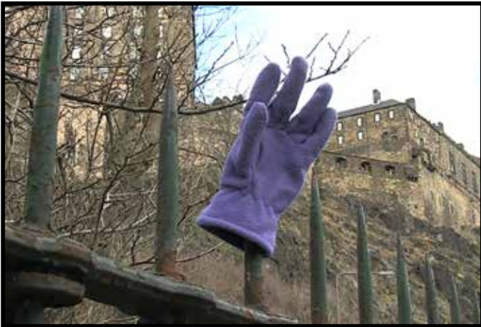
IN A FOREIGN LAND, March 21, 24