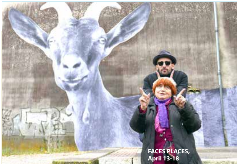
FACES PLACES, April 13-18